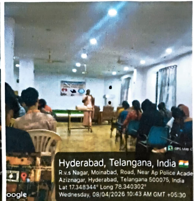
Hyderabad, Telangana, India R.v.s Nagar, Moinabad, Road, Near Ap Police Acade Aziznagar, Hyderabad, Telangana 500075, India Lat 17.348344° Long 78.340302° Wednesday, 08/04/2026 10:43 AM GMT +05:30