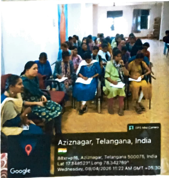
Aziznagar, Telangana, India 88xx+pf6, Aziznagar, Telangana 500075, India Lat 17.348523° Long 78.342789° Wednesday, 08/04/2026 11:22 AM GMT +05:30