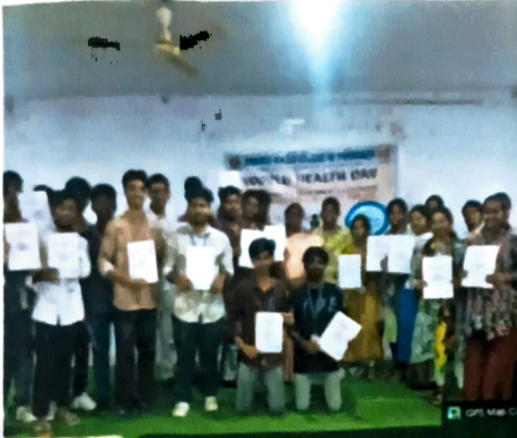
Hyderabad, Telangana, India R.v.s Nagar, Moinabad, Road, Near Ap Police Acader Aziznagar, Hyderabad, Telangana 500075, India Lat 17.348344° Long 78.340302° Wednesday, 08/04/2026 01:25 PM GMT +05:30