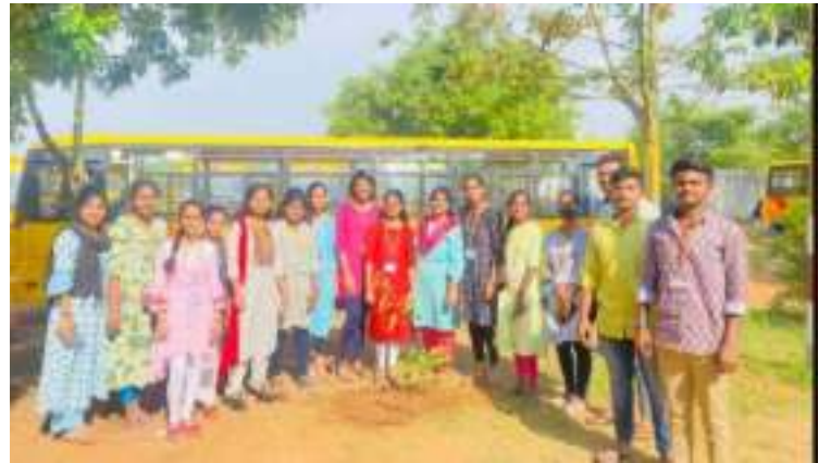
“Telangana Formation Day Celebrations”:02nd-June-2023