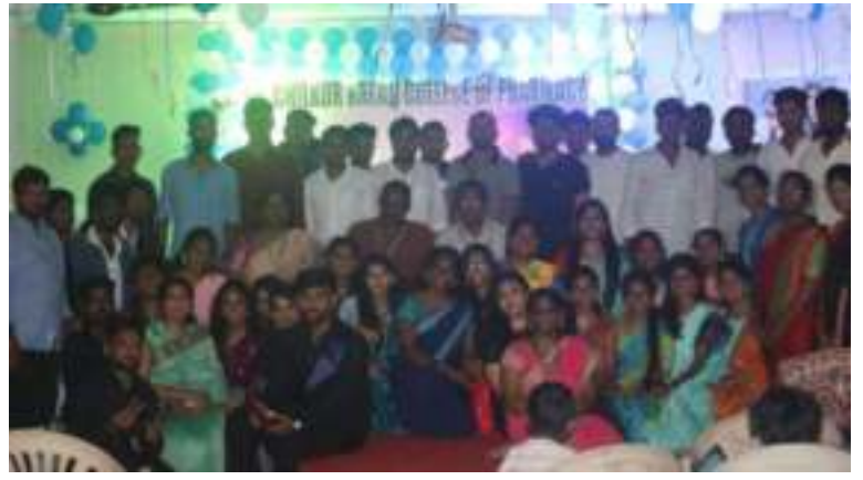
“World Environment Day Celebration”:05th-June-2023